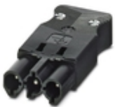
Connector for series connection, black, 3-pos.